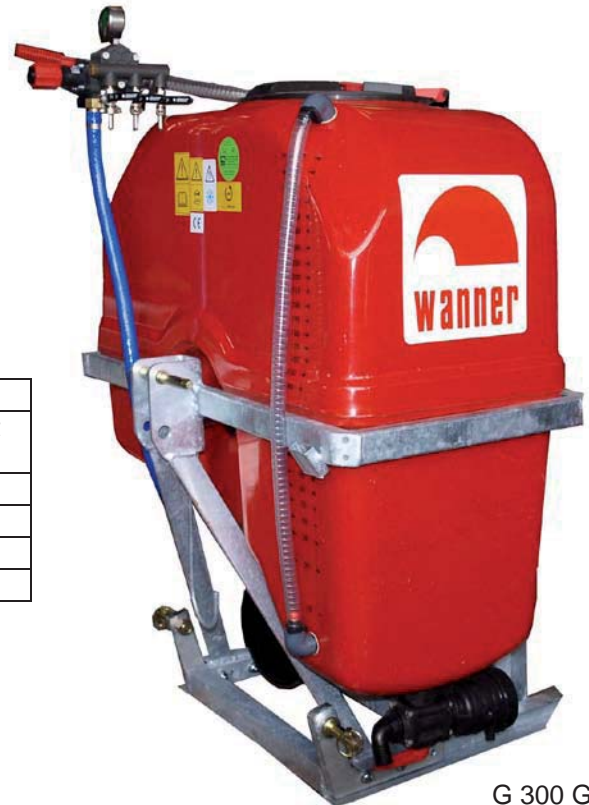
G 300 GFK