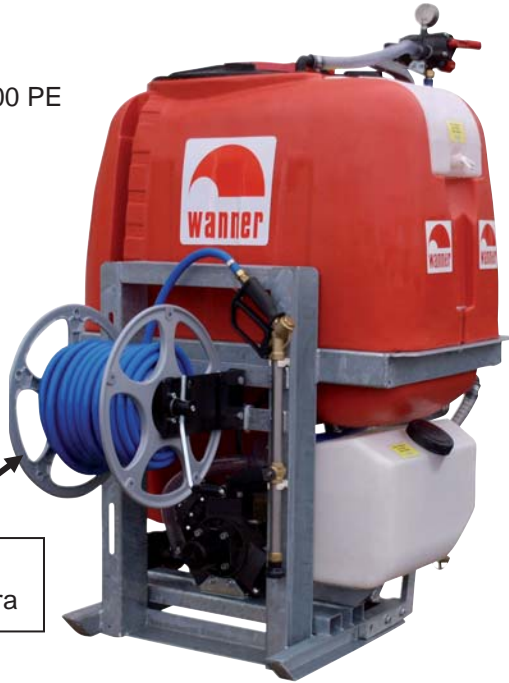
G 400 PE